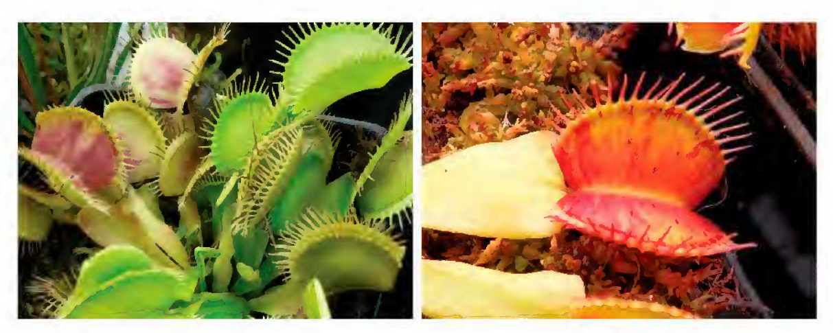
Figure 3: Dionaea 'Iris' plant and trap.

The parentage of Dionaea 'Iris' is unknown because this plant was found in a garden center in September 2010. Dionaea 'Iris' was named in December 2012 by the author.